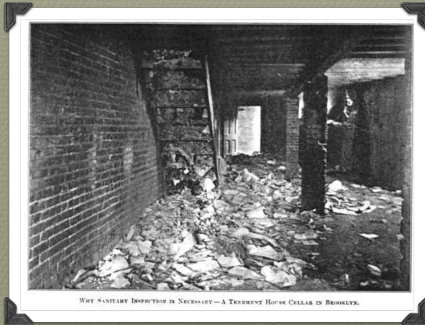
WHY SANITARY INSPECTION IS NECESSARY—A TENEMENT HOUSE CELLAR IN BROOKLYN.